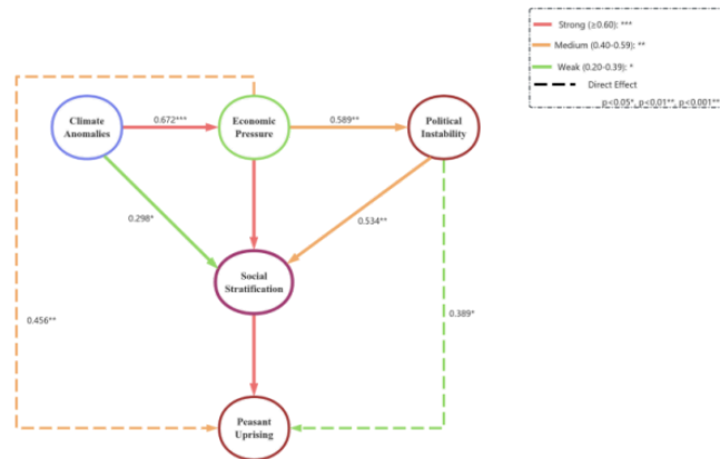
Figure 1. Causal network structure of Chinese peasant uprising triggers

This study models a 2,414-year causal network of peasant uprisings (Figure 1), showing that climate shocks lead to economic stress, which transmits through political and social pressures to trigger uprisings. Causal strengths for climate–economy, economy–politics, and politics–society are 0.672, 0.589, and 0.751 respectively, highlighting the central role of social mobilization.